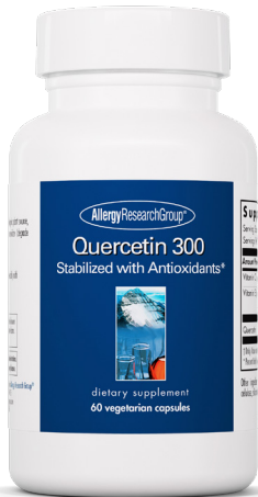
#70060 60 vegetarian capsules