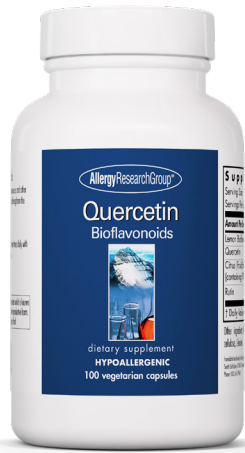
#70050 100 vegetarian capsules